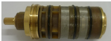
20071 - Thermostatic Cartridge