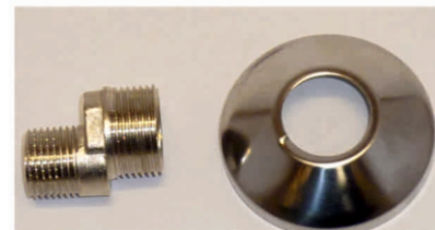
05RE31CR - Concealing Plate with Connector