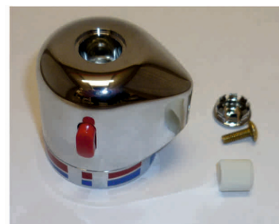
20MM.PL2.CP1 - Temperature Control Handle