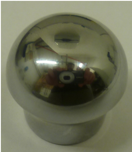
922248CP - Diverter Knob