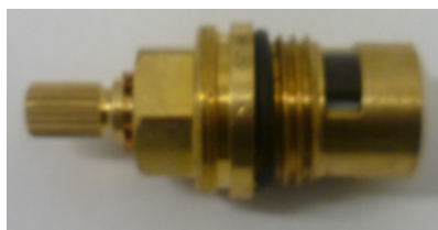
VC.03FL.CP - Flow Control Cartridge