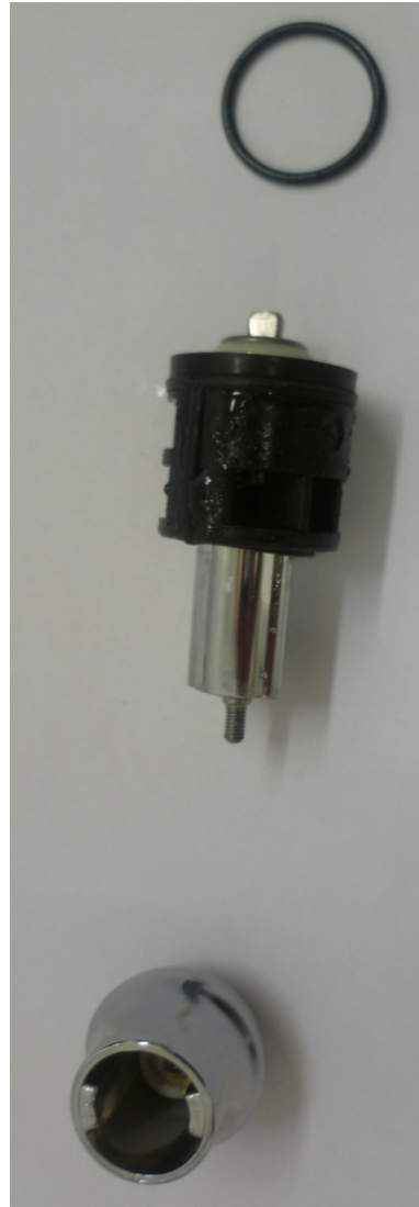
05GD08CR - Diverter Assembly