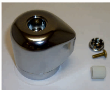
20MC.PL2.CP1 - Flow Control Handle