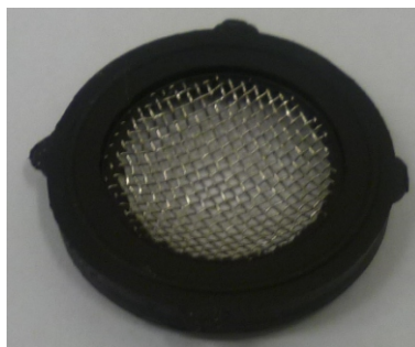
8716108240 - Rubber Washer with Filter