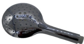
HS1007CP - Handset