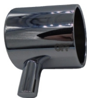
PU100002XX - Flow Handle