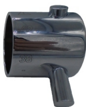
PU100001XX - Temperature Handle