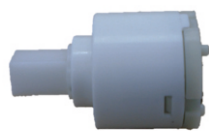
PU100004XX - Flow Cartridge