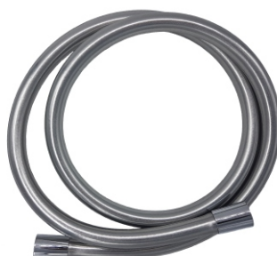
800030CP - Smooth Hose