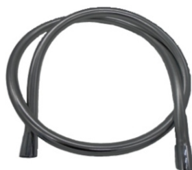
800030CP- Smooth Hose