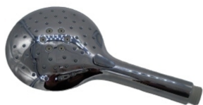
HS1007CP - Handset