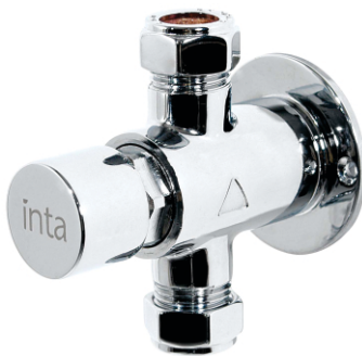
Time Flow Shower Exposed TF997CP

Water conservation is essential and in some public establishments where multiple water outlets are used, the Inta range of Time Flow Control systems are an eco-friendly, stylish and economical solution to the problem of water wastage. All of the Inta Time Flow Controls are designed to work with the Intamix range of the Thermostatic Mixing Valves