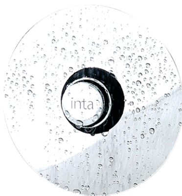
Time Flow Shower Concealed TF997CP